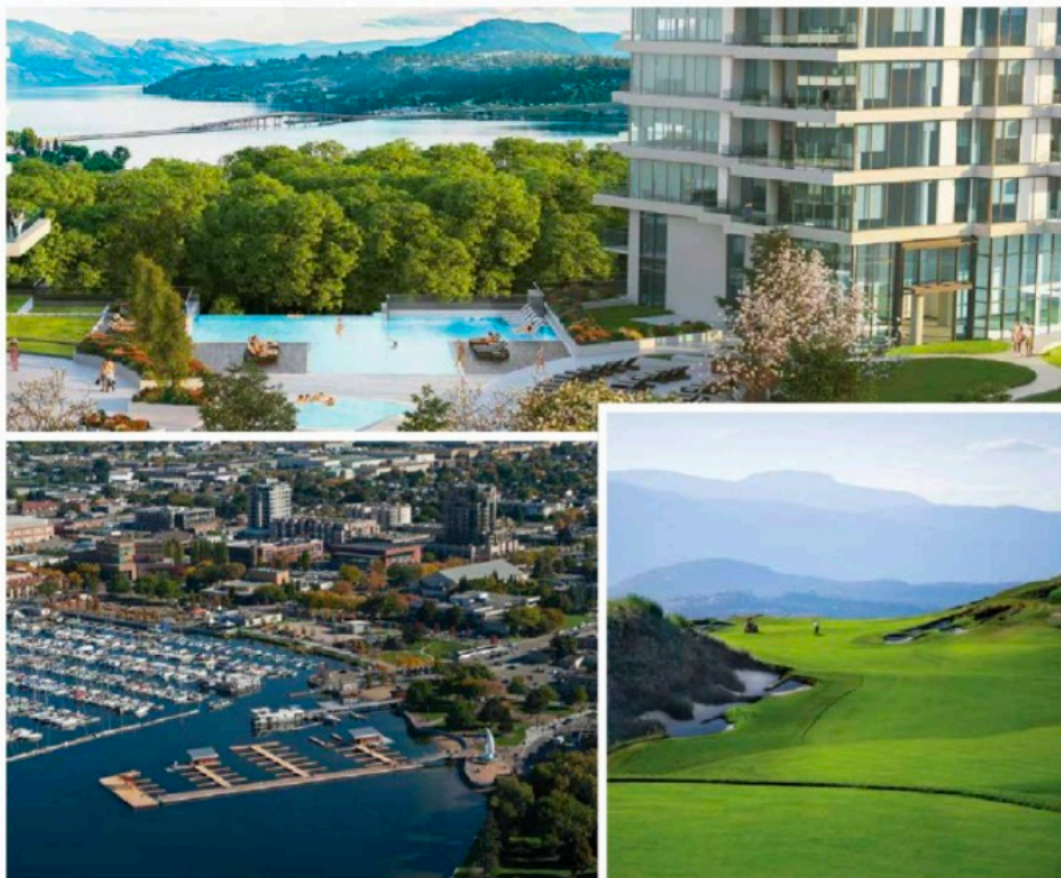
Previous page: ONE Water Street, Kelowna Left: The elevated recreation area at ONE Water Street, Kelowna Bottom Left: Kelowna Downtown Marina Bottom Right: Tower Ranch Golf and Country Club